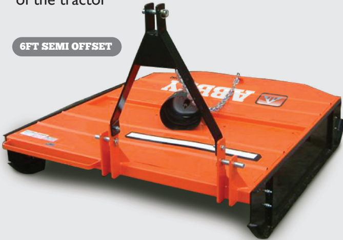
6FT SEMI OFFSET

Runs offset of the left hand tyre of the tractor